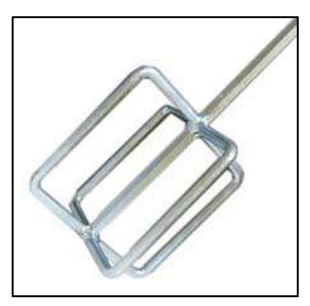
Figure 2: Eggbeater mixer.